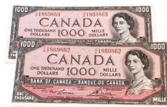
Canada stopped producing $25 and $500 bank notes in 1935, and they ceased to be legal tender as of January 1, 2021, along with the $1, $2, and $1,000 bills from every Bank of Canada series.

Combatting crime is also why an entire regime was established in Canada (and other countries) that requires casinos, banks, and other financial institutions to report any transactions (or combined transactions within 24 hours) of $10,000 or more, regardless of the payment method. 68, 69 Some jurisdictions have gone further: A new provision in Quebec’s Bill 54, adopted in March 2024, makes it a crime to carry $2,000 or more in cash and requires individuals to justify their possession of such sums, even without evidence of criminal activity. 70