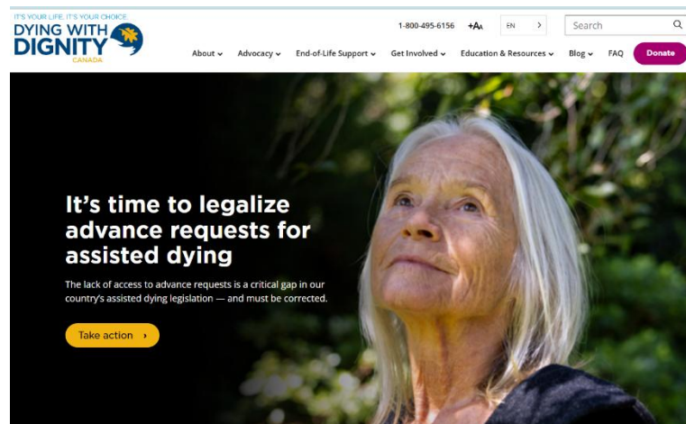
Homepage of Dying with Dignity Canada 25

Canada's premier advocate for assisted suicide, Dying with Dignity Canada (DWDC), 26, 27 is presently campaigning for (among other things) what it calls "advance requests for assisted dying." 28 These "advance requests" – comparable to a power-of-attorney bestowed upon a third party – come into effect should the person-in-question become incapacitated.