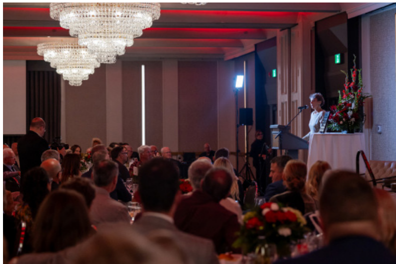
The George Jonas Freedom Award dinner in Calgary