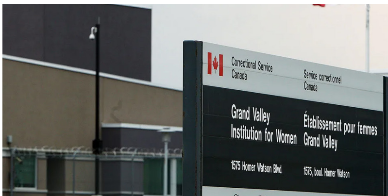
The Grand Valley Institution for Women in Ontario

Since 2017, Correctional Service Canada has allowed male inmates who identify as women to be transferred into federal women’s prisons across Canada, without requiring surgical transition. Before 2017, such transfers generally occurred only after sex reassignment surgery had been completed.