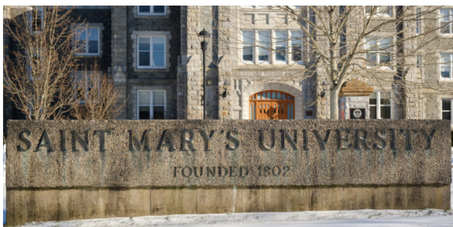
Saint Mary's University in Halifax, Nova Scotia