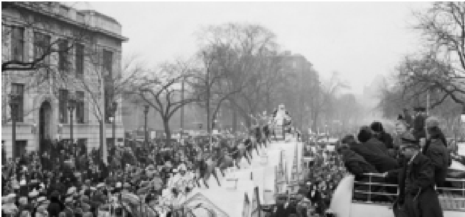
The annual Santa Claus Parade in Toronto, 1934